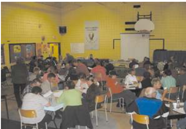
Ashern-Moosehorn Community Consultation

In September 2007, the Lakeshore School Division Board of Trustees will be forming committees in Ashern and Fisher Branch to develop a plan to enable the transition to the new locations to occur as smoothly as possible.