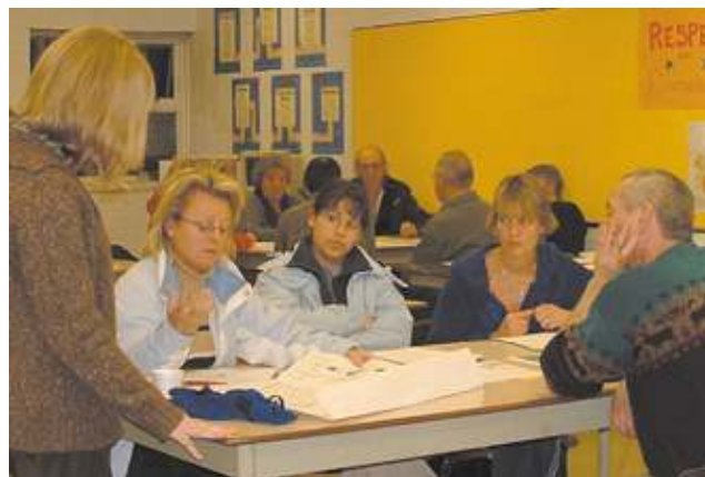
Lundar Community Consultation